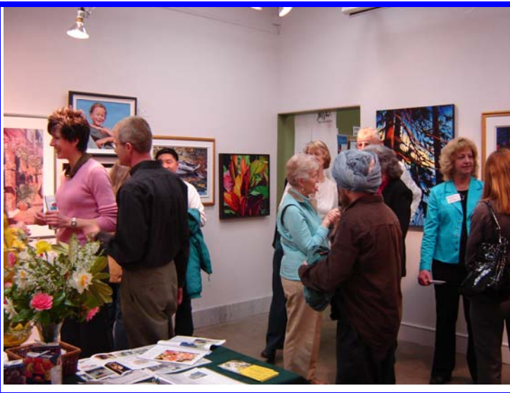
Opening Reception, Spring Show 2009

Refreshments are served at all our Meetings.